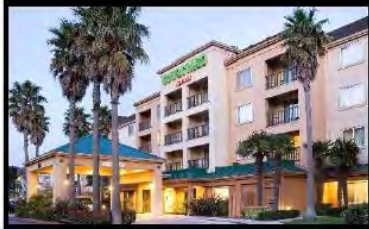
COURTYARD 650.871.4100 CourtyardOysterPoint.com

At the Residence Inn and Courtyard San Francisco Airport Oyster Point Waterfront, we offer the convenient option of choosing a hotel that best fits your needs. From 350 comfortable guest rooms, 5 meeting rooms with 2,757 sq ft of total meeting space, and practical amenities, and a Bayfront location, each of our hotels offers guests a place to stay connected. No matter which hotel you choose, your needs will be met with ease for a memorable experience.