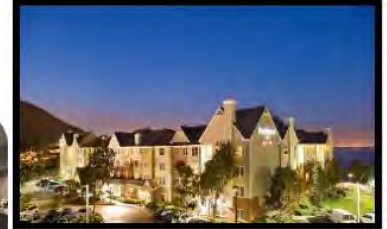
RESIDENCE INN 650.837.9000 ResidenceInnOysterPoint.com