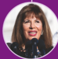
JACKIE SPEIER former Congressmember