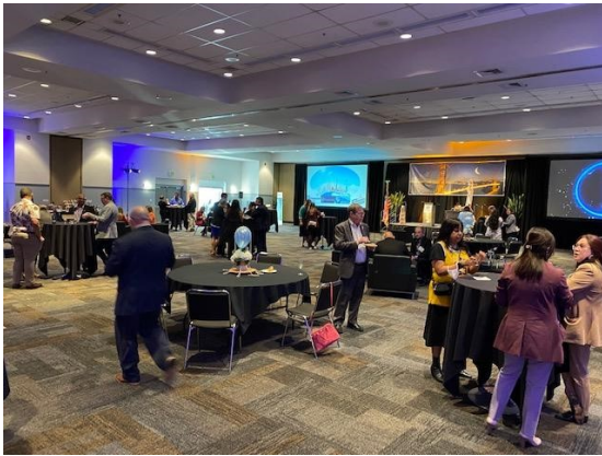
"Welcome Back to the World"