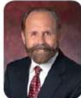
SENATOR JERRY HILL